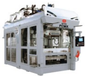
FCMX SERIES Horizontal Parting Flaskless Molding Machine