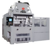
FBOX SERIES Horizontal Parting Flaskless Molding Machine