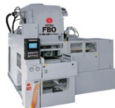
FBO SERIES Horizontal Parting Flaskless Molding Machine